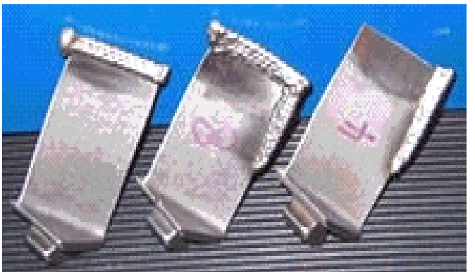
Fig. 3: Turbine blades with laser cladding build-up.

The University of Nottingham has two research centers that have significant SFF activities, the Rolls Royce University Technology Center and the Univ. of Nottingham Institute for Materials Technology (UNIMAT). Rolls Royce has an aircraft engine manufacturing facility near Nottingham and they provide core funding for UTC. One major project is the usage of laser cladding processes for engine blade repair. An example of their work is shown in Fig. 3. Within UNIMAT, have major efforts they in laser welding/cladding, cold spray of metals, thermal spray, and laminated tooling.