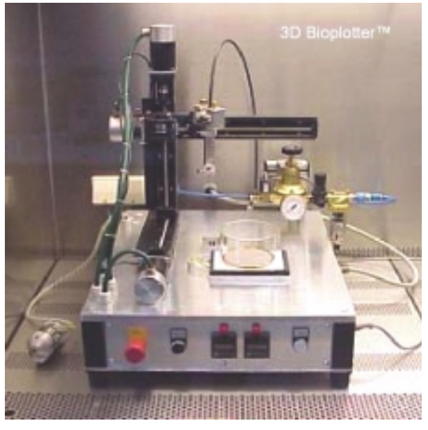
Fig. 2: Bioplotter from EnvisionTec.

In the United Kingdom, the University of Loughborough's Innovative Manufacturing