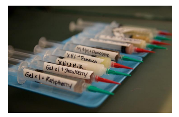
Figure 1 Various hydrocolloid formulations loaded into 10 mL Luer-Lok syringes

Xanthan gum and gelatin were prepared in water at various concentrations, ranging from 0.5% gelatin in water (by weight) to 4% gelatin in water, and from 2% xanthan in water to 16% xanthan in water. After preparation, the hydrocolloid concoctions were loaded into 10 mL syringes.