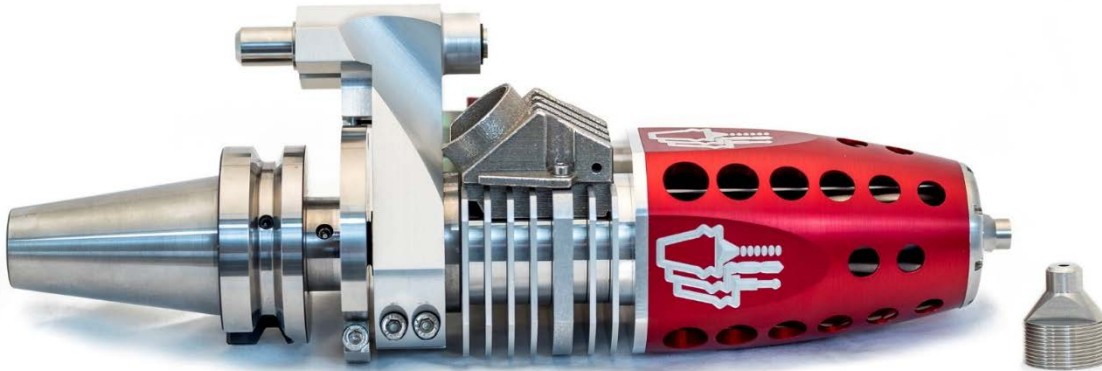
Figure 3. Hybrid Manufacturing Technologies AMBIT PE-1 polymer extruder for CNCs

helps to shear and blend the polymer pellets as they are melted by a heater in the tool. External connections are needed to the temperature control and the pellet hopper. The tool can print in common polymers like ABS up to 9 kg/hr, and can be switched out for subtractive CNC tools or inspection tools to enable true hybrid manufacturing in a single commercially available set up. Because the same pellets are used as in injection molding machines and other well-established processes, a wide variety of possible materials are readily available for cheaper than the equivalent filaments. Figure 4 shows the prototype head installed on the Haas CNC mill at BYU.