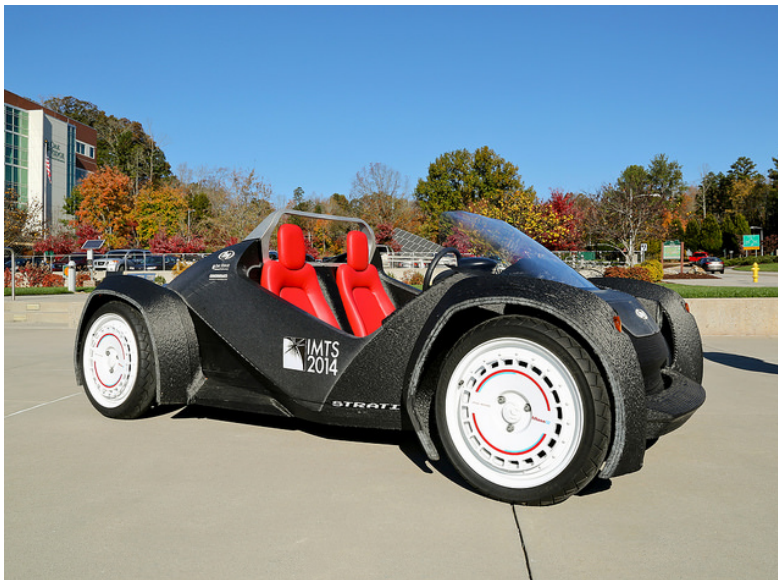
Figure 2. "Strati" 3D-printed car, manufactured in part through BAAM process

Another technology that is relevant to this paper is that of room-scale polymer extrusion systems, such as big area additive manufacturing (BAAM) (Figure 2). In these systems, large nozzles, efficient heating and shearing subsystems, and the use of polymer pellets instead of filament as feedstock enable high speed fabrication with thick layer heights and large part footprints.